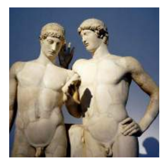
Who are they? Orestes and Pylades are two great friends in Aeschylus' Coefore.